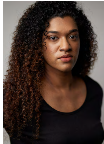
Click image to view comp card.