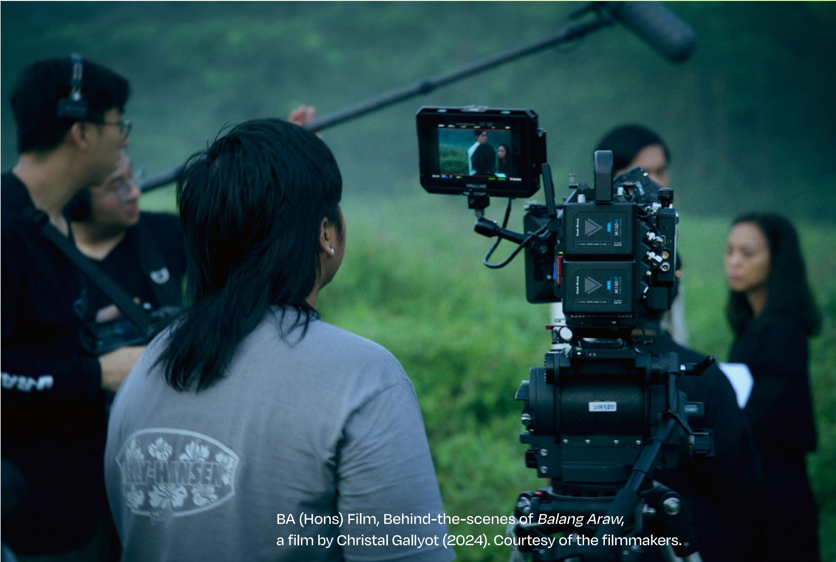
BA (Hons) Film, Behind-the-scenes of Balang Araw , a film by Christal Gallyot (2024).