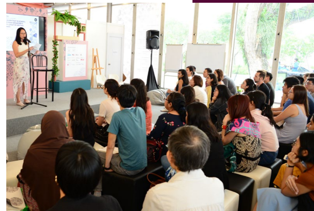
Image: Reading by MA Creative Writing students at Singapore Writers Festival, 2018.

Postgraduate students are constantly exposed to first-hand experience in current practices of research and creation, leading to the acquiring of powerful knowledge and a wide set of skills by the time you graduate. You will have opportunities to develop expertise in accordance with your research interests.