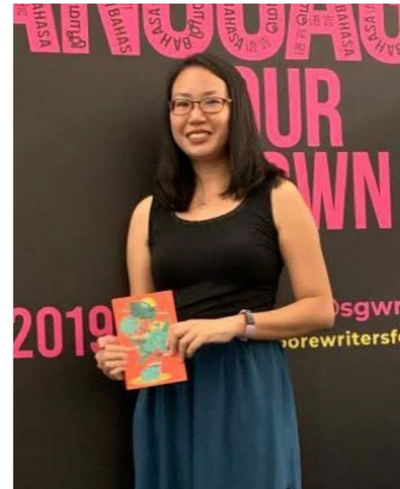
Image: MA Creative Writing students at the George Town Literary Festival, 2019.