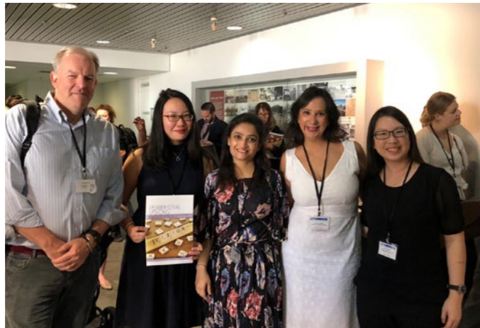
Image: MA Creative Writing students at the 23rd Annual Australasian Association of Writing Programs (AAWP) Conference in Perth, Australia.

Timeless philosophical questions about identity, knowledge, individuality, work, community, family, nationality, love, ethics and meaning arise through sustained, informed and self-aware writing.