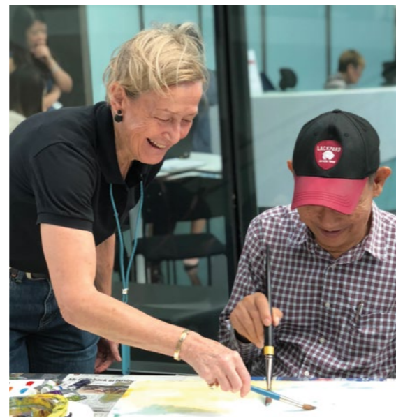
Image: MA Art Therapy student facilitating a community arts project.

This module provides the foundation for the programme and the theoretical framework for safe and professional clinical art therapy practice. You are introduced to the history of art therapy and psychodynamic theory that has evolved from object relations into intersubjective theory and how these theories can be connected to the making of artwork. The importance of attachment, transference and countertransference, sublimation and trauma are all elements for discussion and incorporated into assignments. You will develop a beginning understanding of key psychodynamic theory, concepts and terms as related to professional art therapy practice.