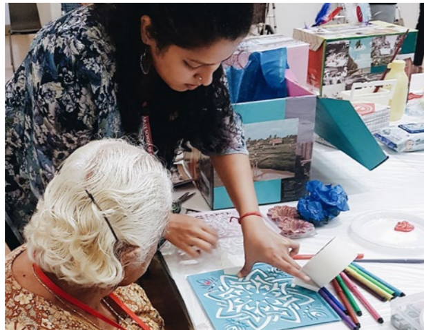
Image: Students facilitating a community project.