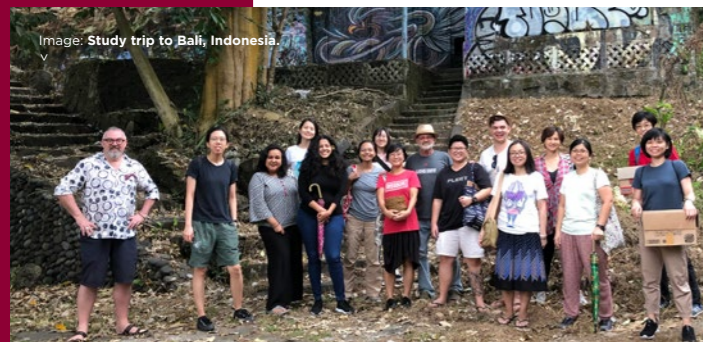
Image: Study trip to Bali, Indonesia.