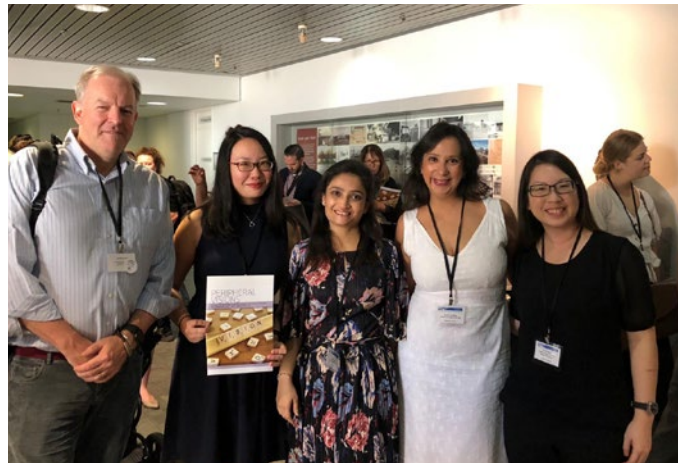
Image: MA Creative Writing students at the 23rd Annual Australasian Association of Writing Programs (AAWP) Conference in Perth, Australia.

Timeless philosophical questions about identity, knowledge, individuality, work, community, family, nationality, love, ethics and meaning arise through sustained, informed and self-aware writing.