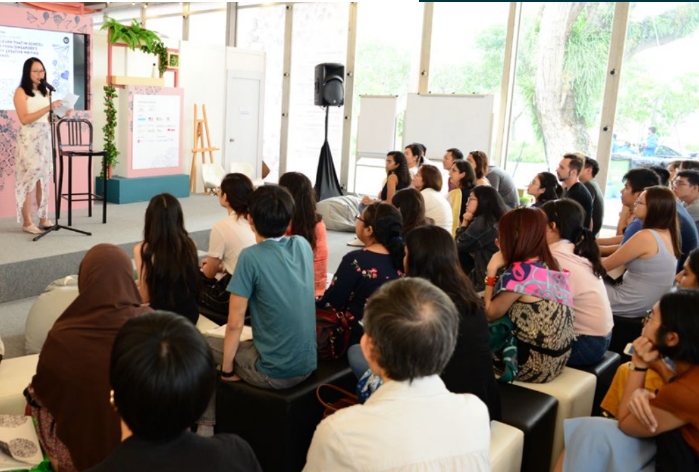
Image: Reading by MA Creative Writing students at Singapore Writers Festival, 2018. v

The programme explores in detail theoretical understandings, practical approaches and professional techniques applied in creative writing across multiple forms and genres – you develop and apply these through your own creative exercises and projects. Your writing is shared, discussed and critiqued by both tutors and peers in regular group workshops. Workshops are an important element of the programme, providing continuing constructive feedback, practical editing experience and ideas for further development and enhancement.