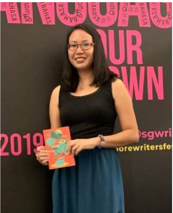
Image: MA Creative Writing students at the George Town Literary Festival, 2019.