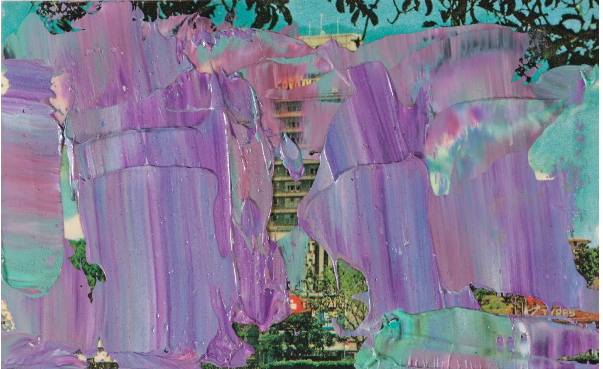
Parergon (landscape: Golden Mile)