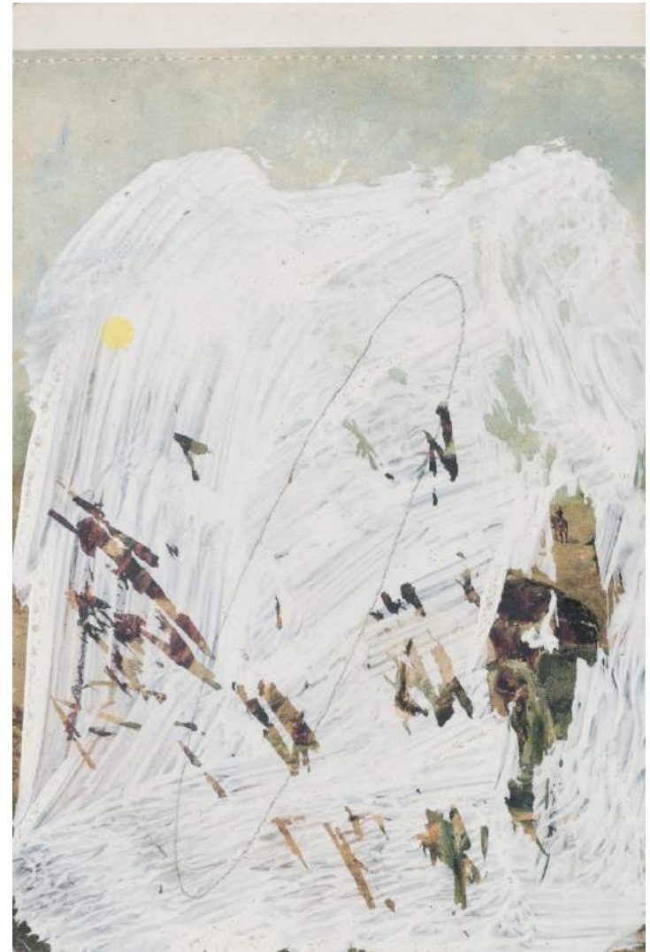
▼ Parergon (Ellipse)

- 2010 Pencil and emulsion on postcard 15 x 10.5 cm