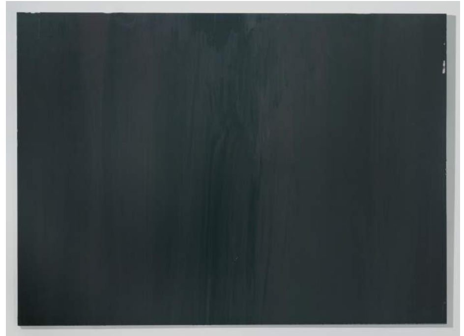
Enamels (Large grey)

2011 Enamel paint on aluminium composite 125 x 172 cm