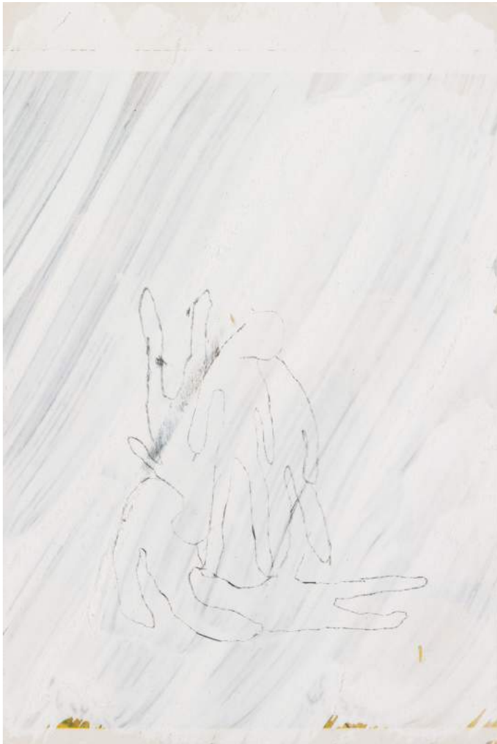
▼ Parergon (stacked figures)

- 2010 Pencil and emulsion on postcard 15 x 10.5 cm