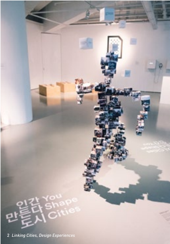
2 Linking Cities, Design Experiences

This module introduces you to the impacts of design on human civilisation through its changing values in relation to political, social, economic and technological developments. You will be required to identify design beyond the scope of problem-solving or outcome-based activities and analyse it as a form of social critique and self-enquiry leading towards design thinking.