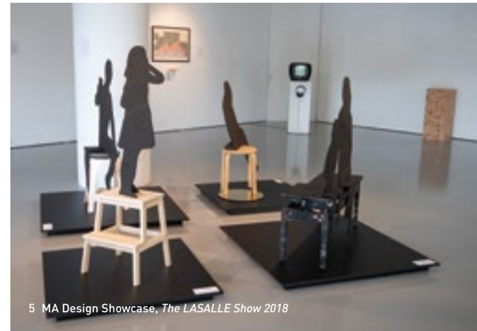
5 MA Design Showcase, The LASALLE Show 2018