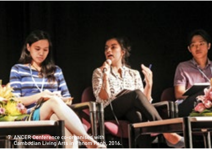
7 ANCER Conference co-organised with Cambodian Living Arts in Phnom Penh, 2016.