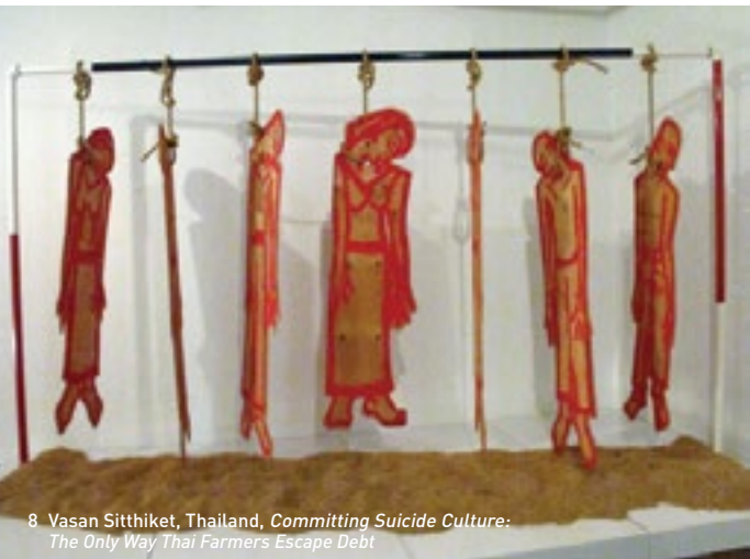
8 Vasan Sitthiket, Thailand, Committing Suicide Culture: The Only Way Thai Farmers Escape Debt