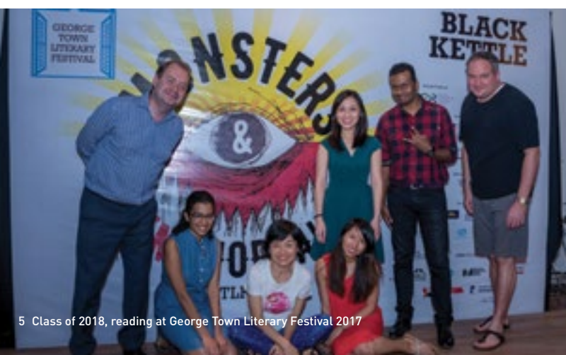
5 Class of 2018, reading at George Town Literary Festival 2017