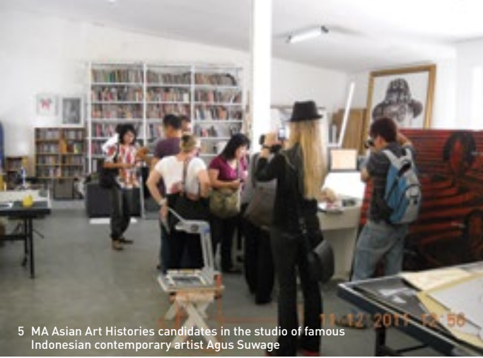
5 MA Asian Art Histories candidates in the studio of famous Indonesian contemporary artist Agus Suwage