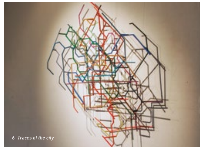
6 Traces of the city