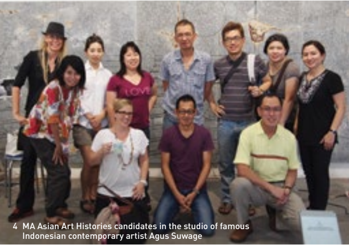
4 MA Asian Art Histories candidates in the studio of famous Indonesian contemporary artist Agus Suwage