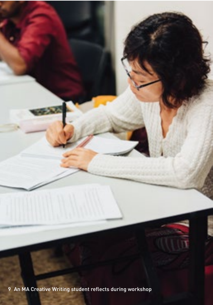
9 An MA Creative Writing student reflects during workshop