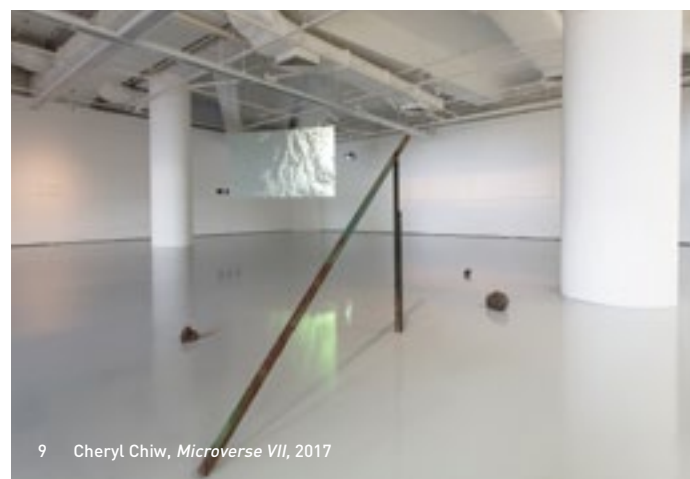
9 Cheryl Chiw, Microverse VII, 2017