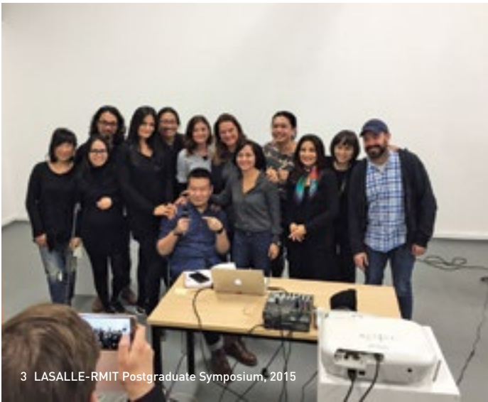
3 LASALLE-RMIT Postgraduate Symposium, 2015