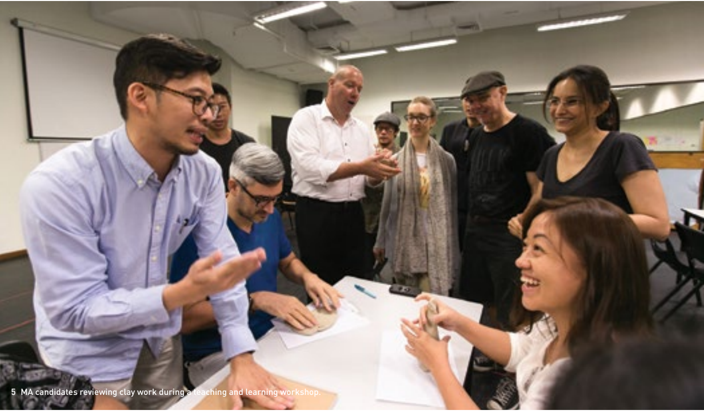
5 MA candidates reviewing clay work during a teaching and learning workshop.