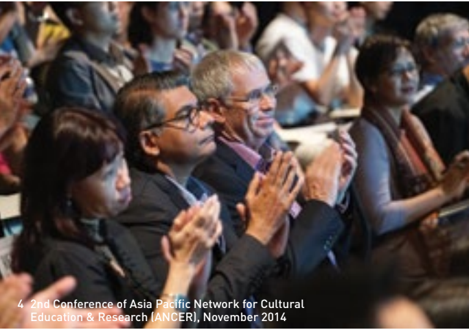
4 2nd Conference of Asia Pacific Network for Cultural Education & Research (ANCER), November 2014