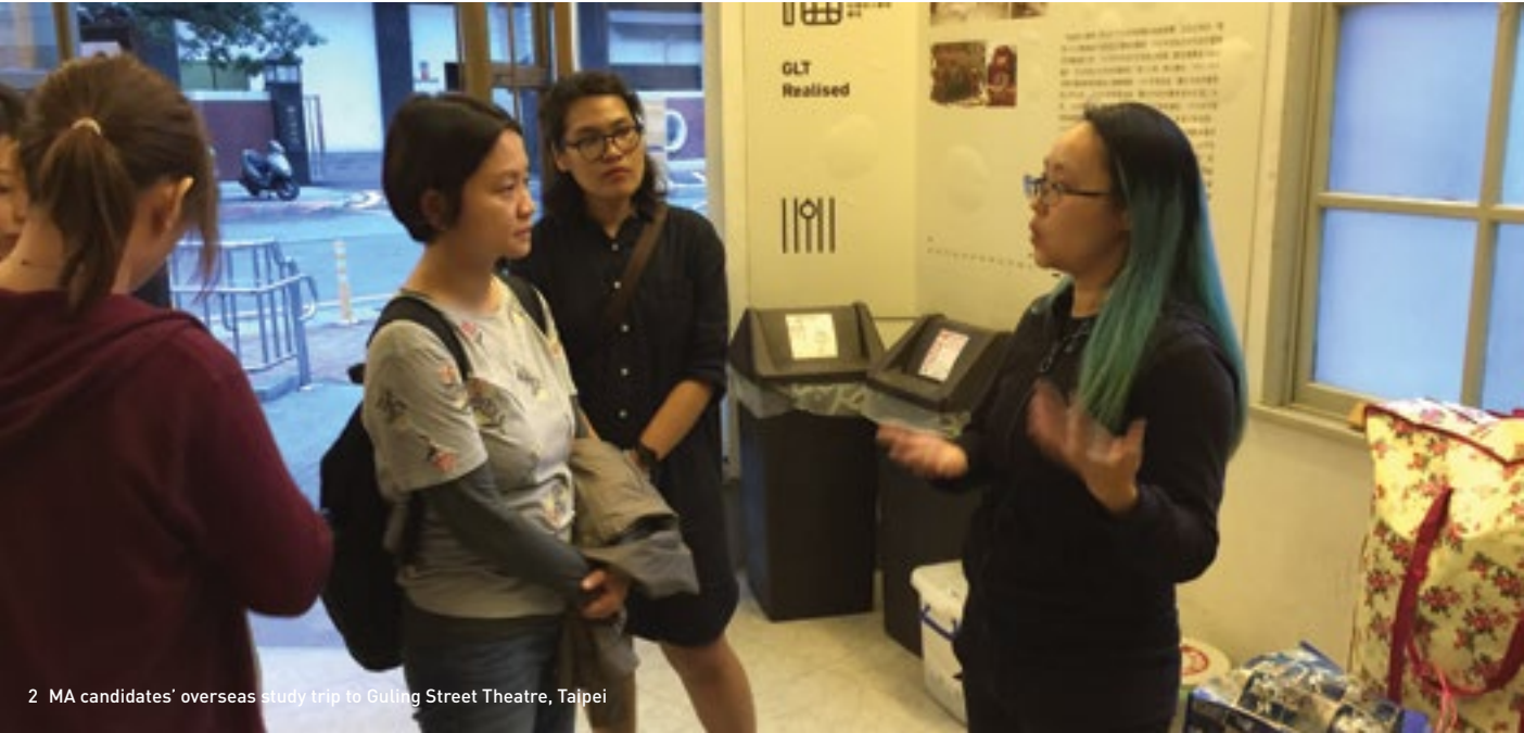
2 MA candidates' overseas study trip to Guling Street Theatre, Taipei