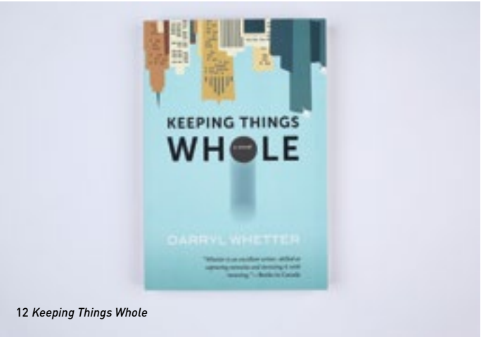
12 Keeping Things Whole