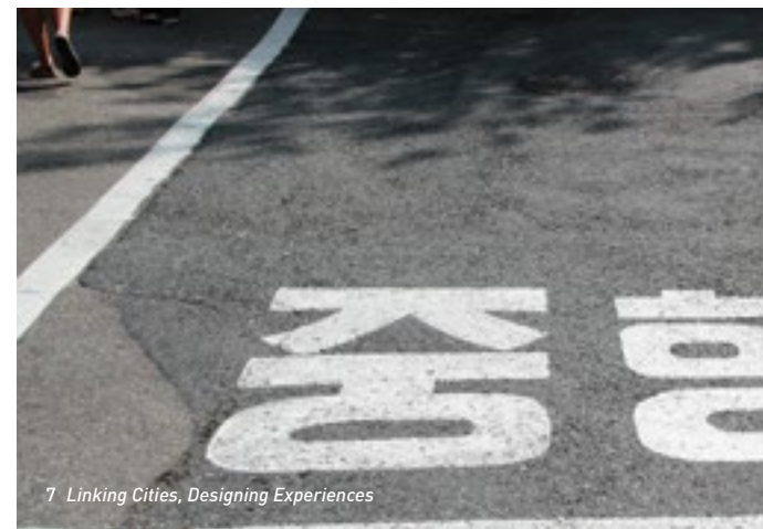
7 Linking Cities, Designing Experiences