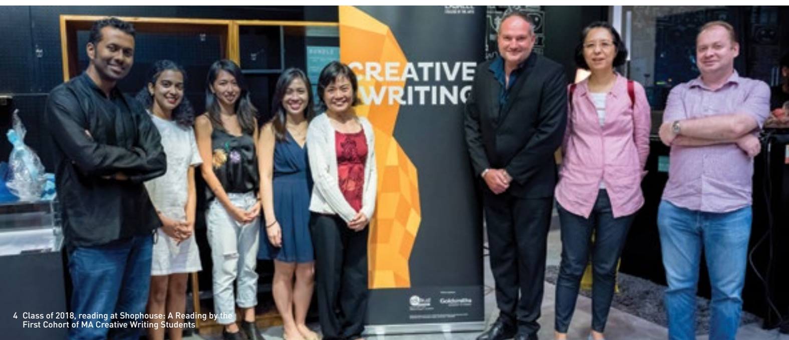
4 Class of 2018, reading at Shophouse: A Reading by the First Cohort of MA Creative Writing Students