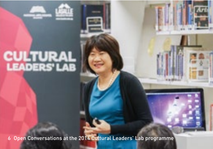
6 Open Conversations at the 2014 Cultural Leaders' Lab programme

We welcome students from diverse professional and cultural backgrounds.