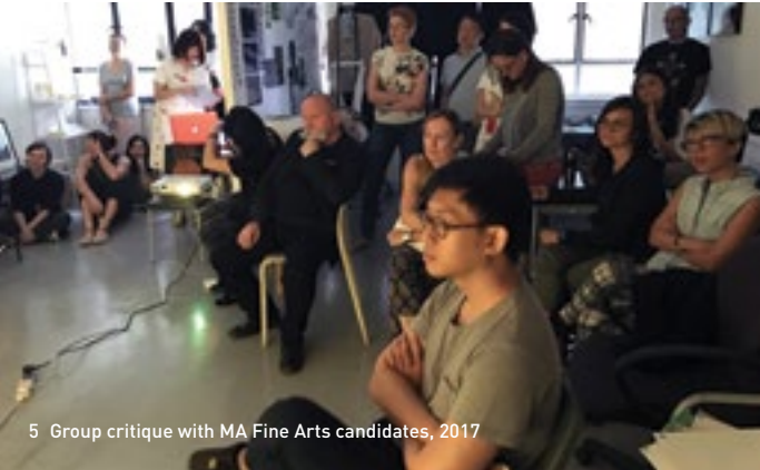
5 Group critique with MA Fine Arts candidates, 2017

A study trip will be organised to enable you to learn how artists and art communities respond to differing social and cultural contexts in the production of art. Harnessing the benefits of experiential learning, this study trip will include visits to artists' studios, galleries, biennales and art spaces. At the same time, it offers invaluable research opportunities through networking with local art communities.