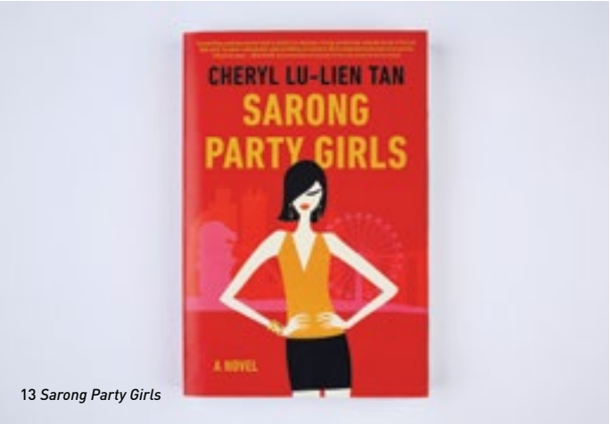
13 Sarong Party Girls