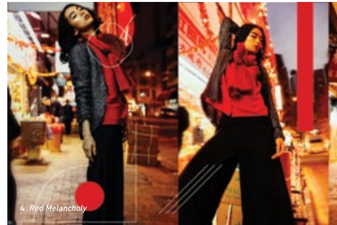
4 Red Melancholy