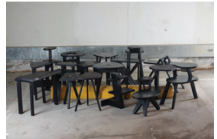
Image: Furniture Workshop with Norwegian Designer of the Year 2017 Hallgeir Homstvedt